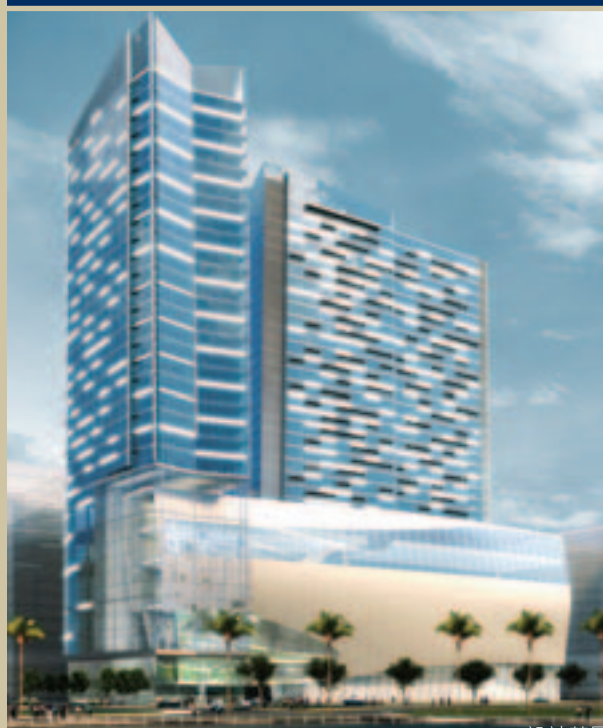
Artist's impression 設計藍圖

MACAU PENINSULA PROJECT 澳門半島項目 A prime site mixed-use casino hotel and residential development on Macau's famous peninsula 位於澳門半島黃金地段的綜合娛樂酒店項目