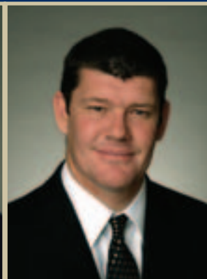
James D. Packer