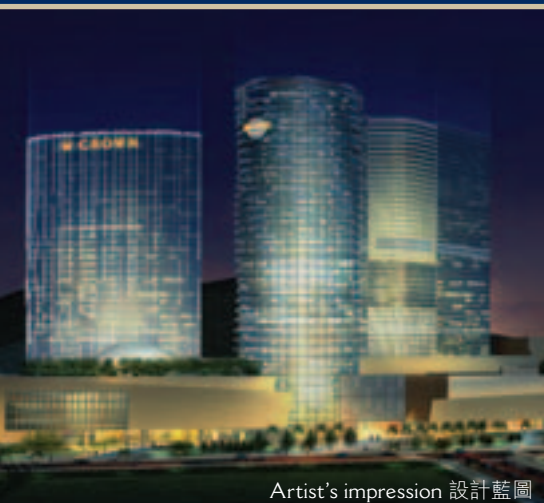
Artist's impression 設計藍圖